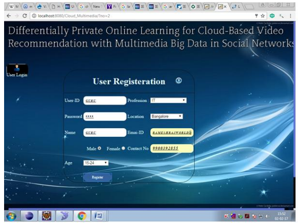
Figure 3 Page to Register