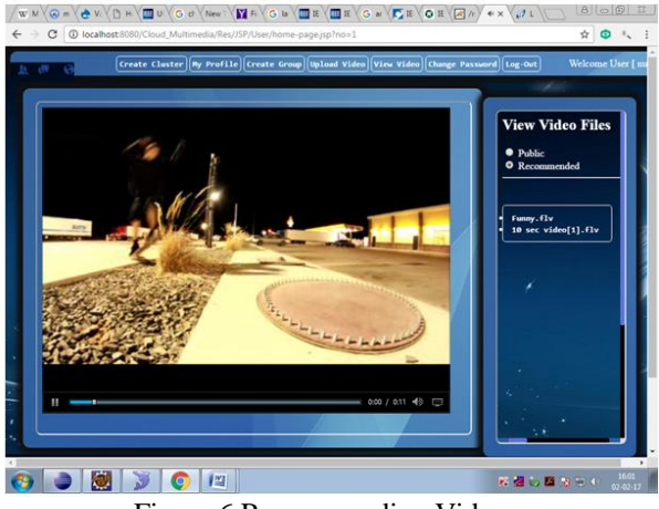
Figure 6 Recommending Videos

Here, personalized distributed online service is used. This helps any one sitting in any corner of the world with internet access at any time to share, retrieve or store videos that they like. This paper constitutes of personal clusters with people of same categories (location, age group, profession) to recommend each other videos that they