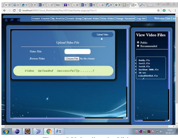
Figure 5 Uploading the Video